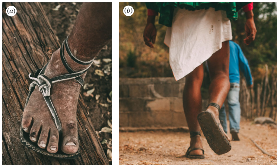
Figure 1. Traditional Tarahumara sandals ( huaraches ). (a) Tarahumara man wearing sandals with soles made from car tyres and a leather thong that goes between the first and second toes and wraps around the ankle. (b) Tarahumara man walking in traditional sandals.

Tarahumara sandals differ little from those documented by early ethnographers or those recovered from archaeological sites [33].